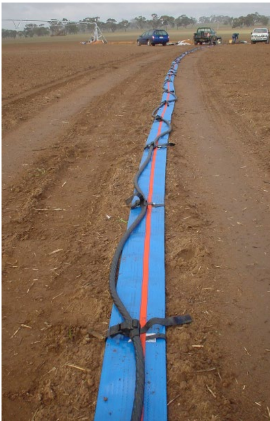
Power cable secured with FlexiStraps