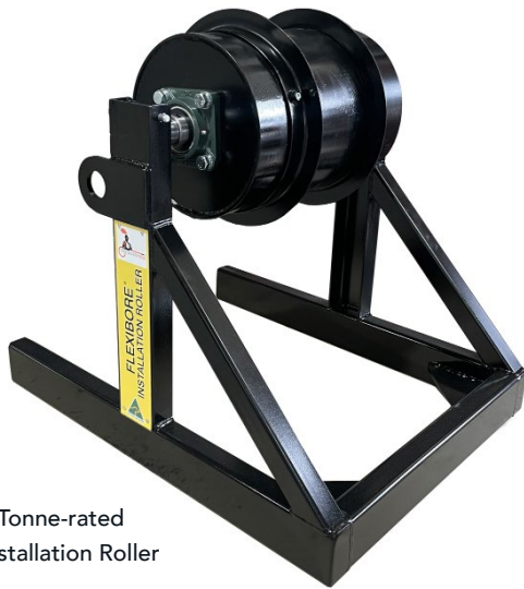
5 Tonne-rated Installation Roller

The Crusader Hose Installation Roller is a valuable Flexibore accessory. Our Installation Roller is the perfect tool for installing or retrieving your submersible pump when using the vehicle installation method.