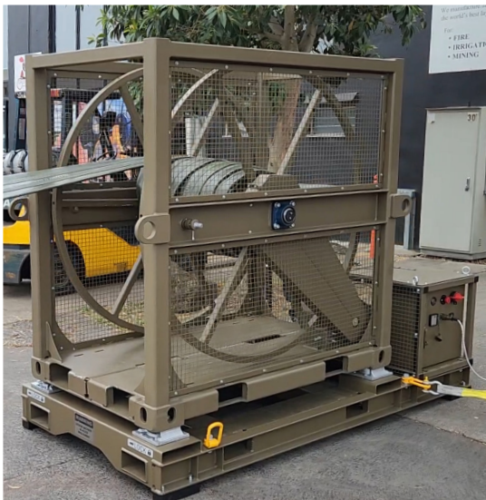
Skid Base with remote drive